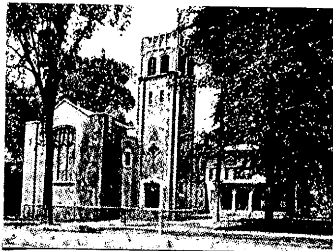
FORMER FIRST UNIVERSALIST SOCIETY UTICA, ONEIDA COUNTY, NY PHOTO 1909