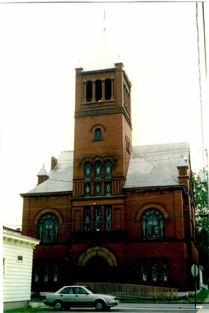
FORMER UNIVERSALIST CHURCH FORT PLAIN, MONTGOMERY COUNTY, NY PHOTO 2000