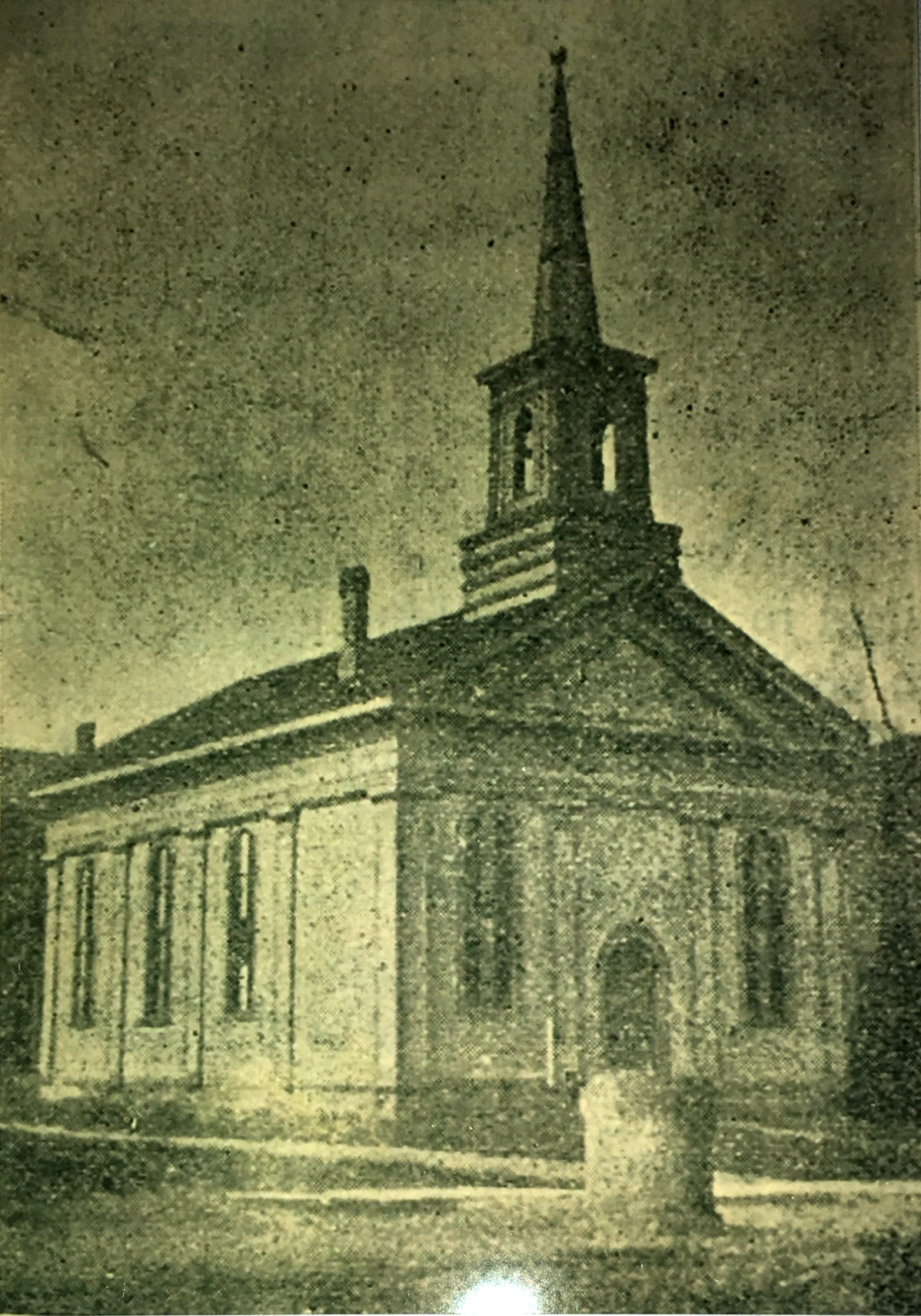
FORMER UNIVERSALIST CHURCH FRIENDSHIP, ALLEGANY CO. NY