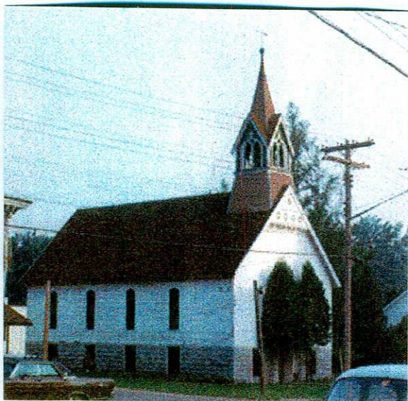
FORMER UNIVERSALIST CHURCH EDWARDS, ST. LAWRENCE COUNTY, NY PHOTO 1967