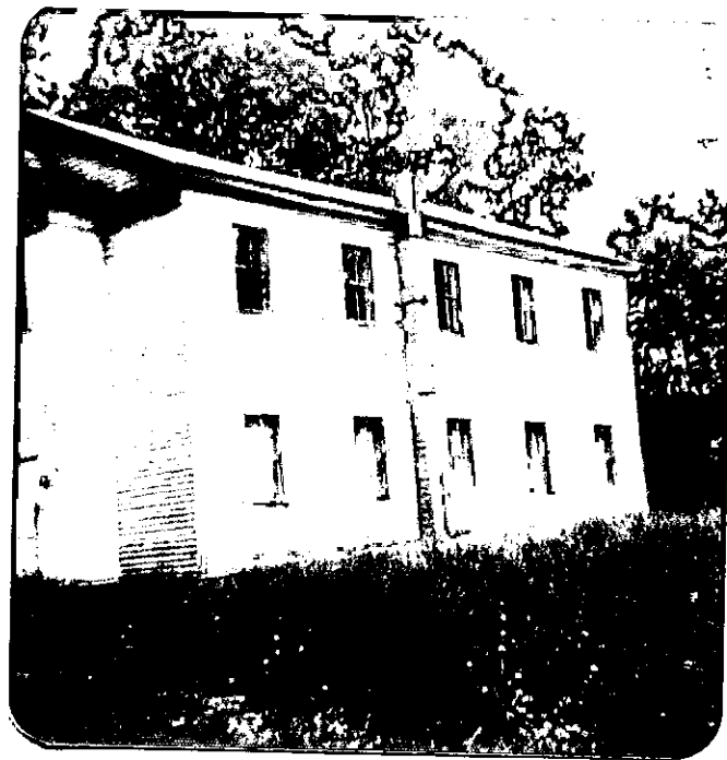
FORMER UNIVERSALIST CHURCH SPEEDSVILLE, TOMPKINS COUNTY, NY