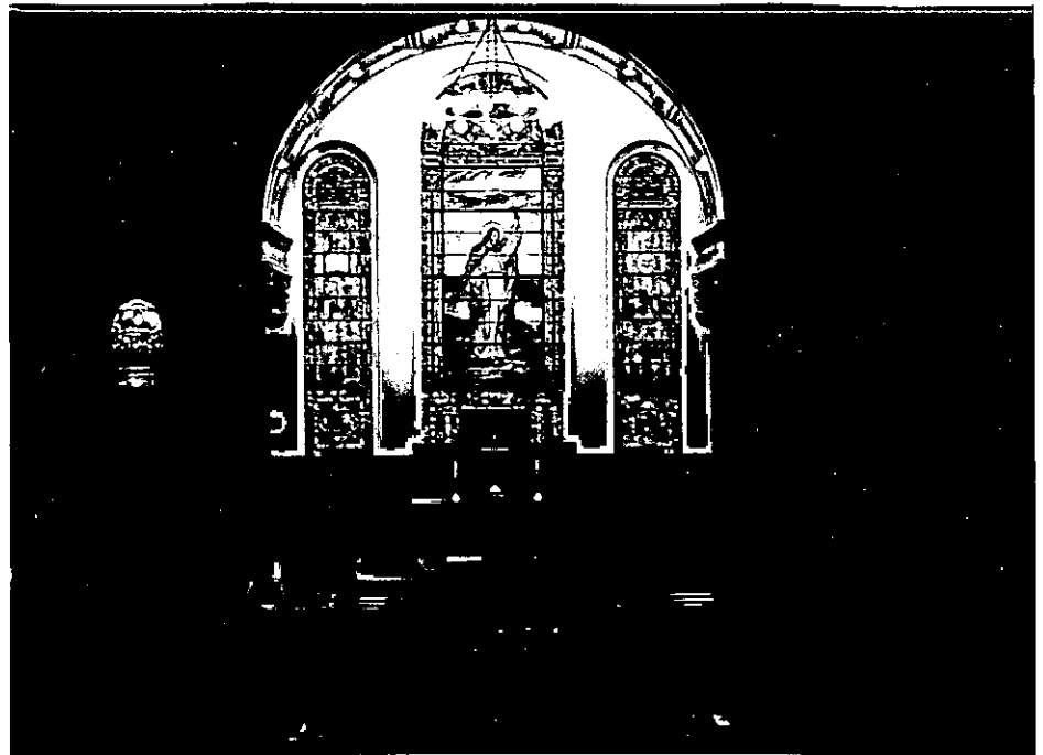
FORMER ALL SOULS UNIVERSALIST CHURCH BROOKLYN, KINGS COUNTY, NY