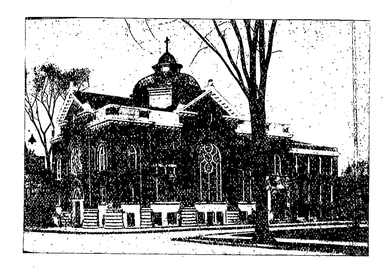
FORMER BETTS MEMORIAL UNIVERSALIST CHURCH SYRACUSE, ONONDAGA COUNTY, NY PHOTO ABT. 1907