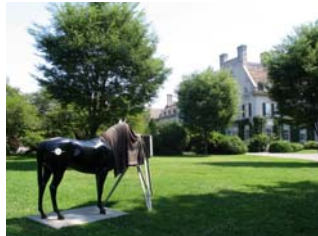
George Eastman House