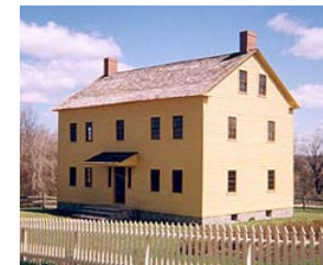
Shaker Trustee Building

Lunch at the GCVM Dinner on your own. 7:30 pm See the Annual Meeting Schedule.