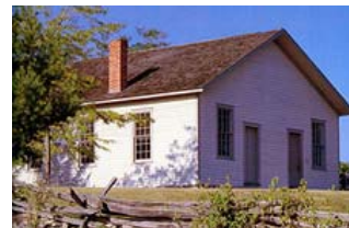
Quaker Meeting House