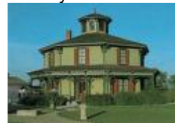
Hyde (Octagon) House

10:00 am Meet at the Genesee Country Village and Museum in Mumford, NY (approx 45 minute drive) Visit Genesee Country Village & Museum, a living history museum breathing life into an authentic 19th-Century Country Village. Explore 68 furnished buildings, including an octagon house. In season, costumed interpreters demonstrate historic activities. One of the largest living history museums in the country, it is also home to the John L. Wehle Art Gallery and a nature center. www.gcv.org